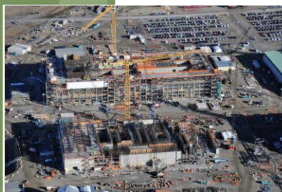
A massive waste treatment complex is being built at Hanford

The WTP is scheduled to begin start-up operations in 2019 and reach full operations by 2022. It will then take 25 years to vitrify all of Hanford's tank waste.